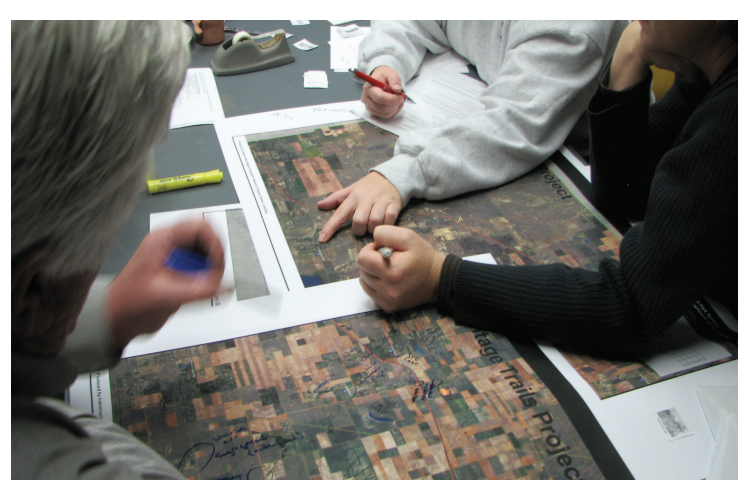
figuring it out together