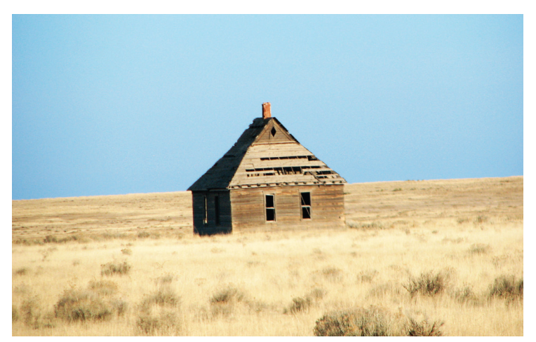
Undiscovered resources in Kiowa County